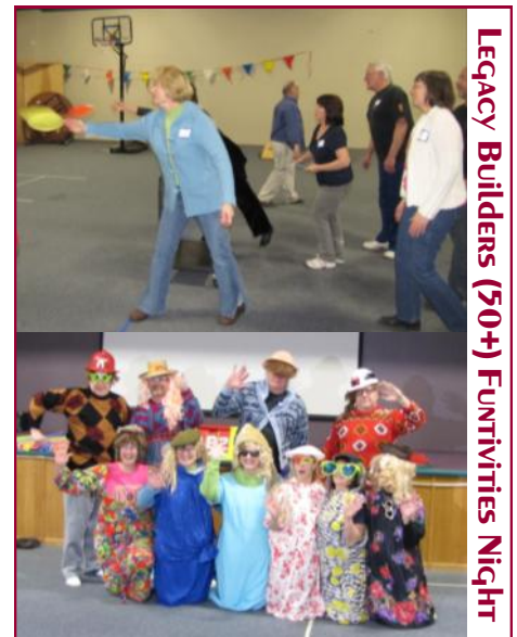
Legacy Builders (50+) Funtrivias Night